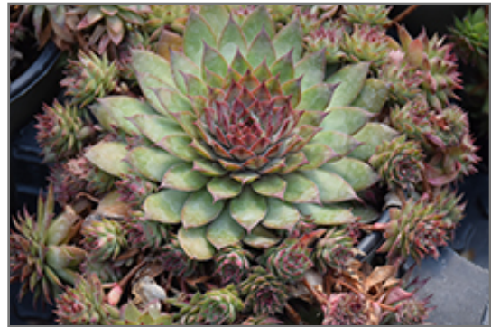
Chick Charms Butterscotch Baby Hens And Chicks

This plant will require occasional maintenance and upkeep, and should not require much pruning, except when necessary, such as to remove dieback. Deer don't particularly care for this plant and will usually leave it alone in favor of tastier treats. Gardeners should be aware of the following characteristic(s) that may warrant special consideration;