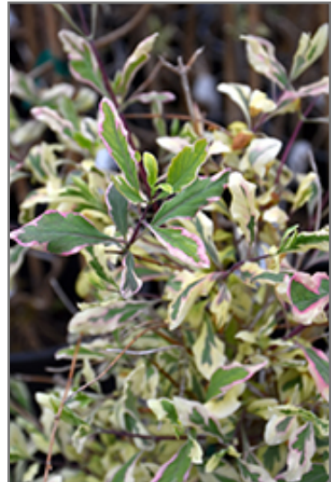
Harlequin Honeysuckle foliage