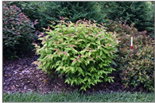
Kodiak Fresh Diervilla