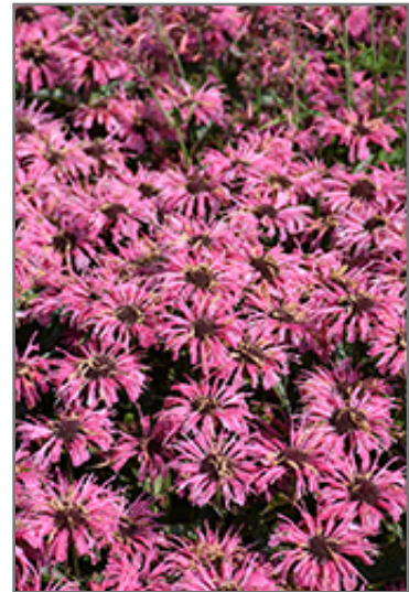
Upscale Pink Chenille Beebalm flowers

Upscale Pink Chenille Beebalm is a fine choice for the garden, but it is also a good selection for planting in outdoor pots and containers. It can be used either as 'filler' or as a 'thriller' in the 'spiller-thriller-filler' container combination, depending on the height and form of the other plants used in the container planting. It is even sizeable enough that it can be grown alone in a suitable container. Note that when growing plants in outdoor containers and baskets, they may require more frequent waterings than they would in the yard or garden.