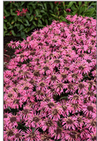
Upscale Pink Chenille Beebalm flowers

Upscale Pink Chenille Beebalm is an herbaceous perennial with a mounded form. Its medium texture blends into the garden, but can always be balanced by a couple of finer or coarser plants for an effective composition.