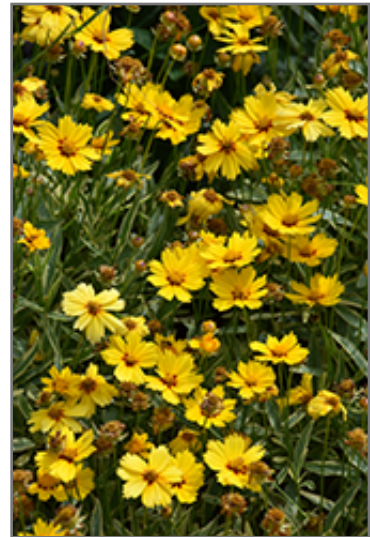
Tequila Sunrise Tickseed flowers