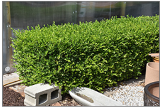
NewGen Independence Boxwood