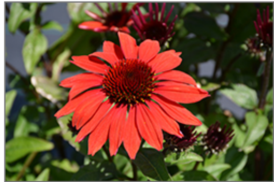
Panama Red Coneflower flowers

This is a relatively low maintenance plant, and is best cleaned up in early spring before it resumes active growth for the season. It is a good choice for attracting birds and butterflies to your yard, but is not particularly attractive to deer who tend to leave it alone in favor of tastier treats. It has no significant negative characteristics.