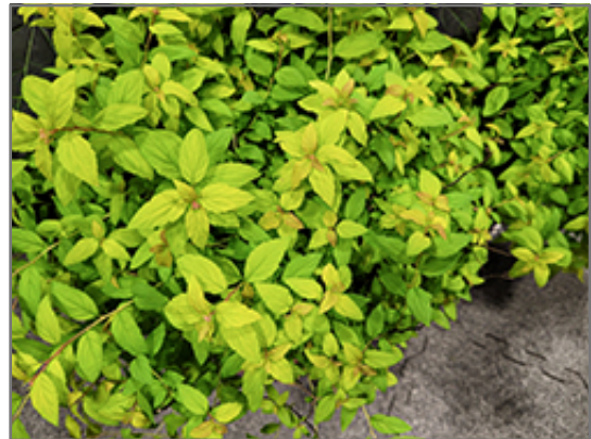
Little Spark Spirea foliage