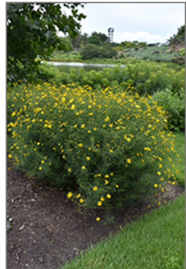
Tickseed in bloom