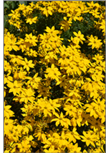
Tickseed flowers

Tickseed is recommended for the following landscape applications;