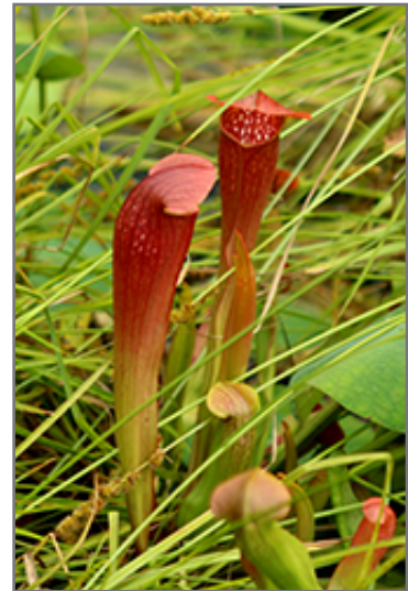
Bug Bat Pitcher Plant