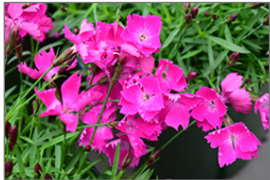
Beauties Kahori Pinks flowers