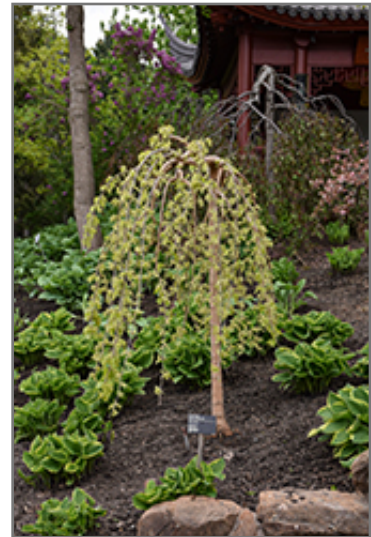
Chaparral Weeping Mulberry in bloom

This shrub performs well in both full sun and full shade. It is very adaptable to both dry and moist locations, and should do just fine under average home landscape conditions. It is considered to be drought-tolerant, and thus makes an ideal choice for xeriscaping or the moisture-conserving landscape. It is not particular as to soil type or pH, and is able to handle environmental salt. It is highly tolerant of urban pollution and will even thrive in inner city environments. This is a selected variety of a species not originally from North America.