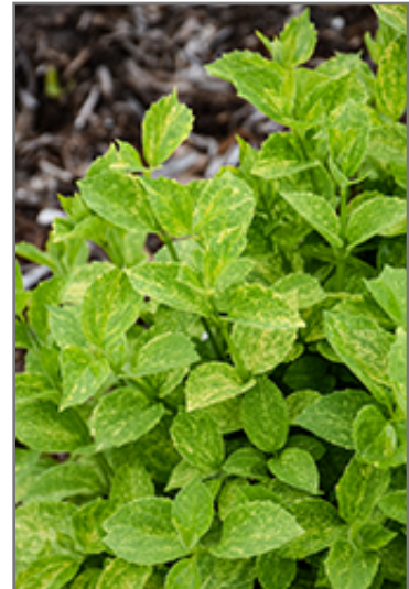
Illuminati Sparks Mockorange foliage