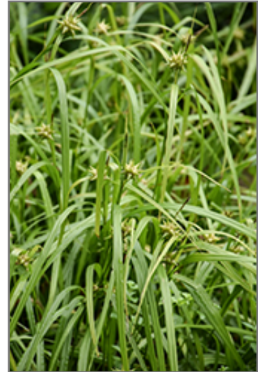
Gray's Sedge flowers