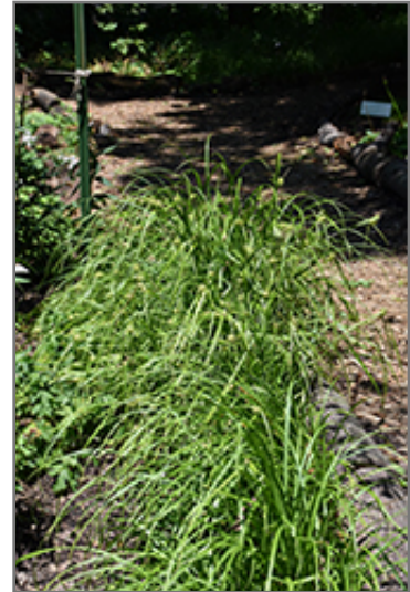
Gray's Sedge

Gray's Sedge is a fine choice for the garden, but it is also a good selection for planting in outdoor pots and containers. With its upright habit of growth, it is best suited for use as a 'thriller' in the 'spiller-thriller-filler' container combination; plant it near the center of the pot, surrounded by smaller plants and those that spill over the edges. It is even sizeable enough that it can be grown alone in a suitable container. Note that when growing plants in outdoor containers and baskets, they may require more frequent waterings than they would in the yard or garden.