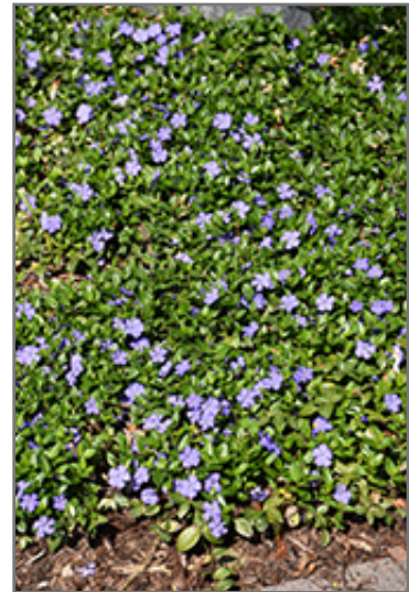
Dart's Blue Periwinkle in bloom