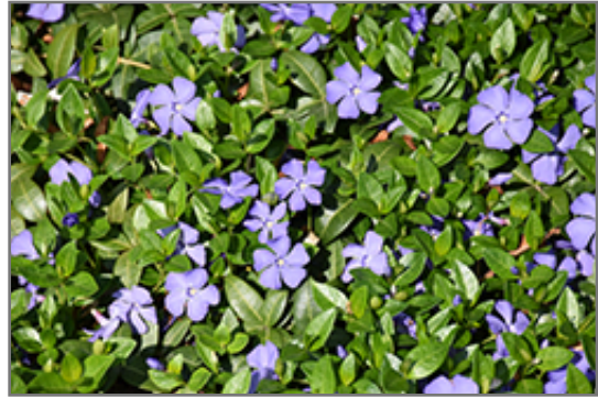
Dart's Blue Periwinkle flowers