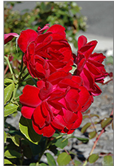
My Girl Rose flowers