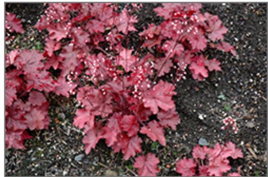
Fire Chief Coral Bells