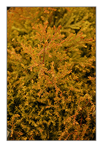
Fire Chief Arborvitae foliage