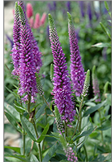
Purpleicious Speedwell flowers

Purpleicious Speedwell is recommended for the following landscape applications;