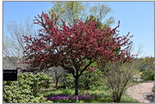
Adams Flowering Crab in bloom

Adams Flowering Crab is recommended for the following landscape applications;